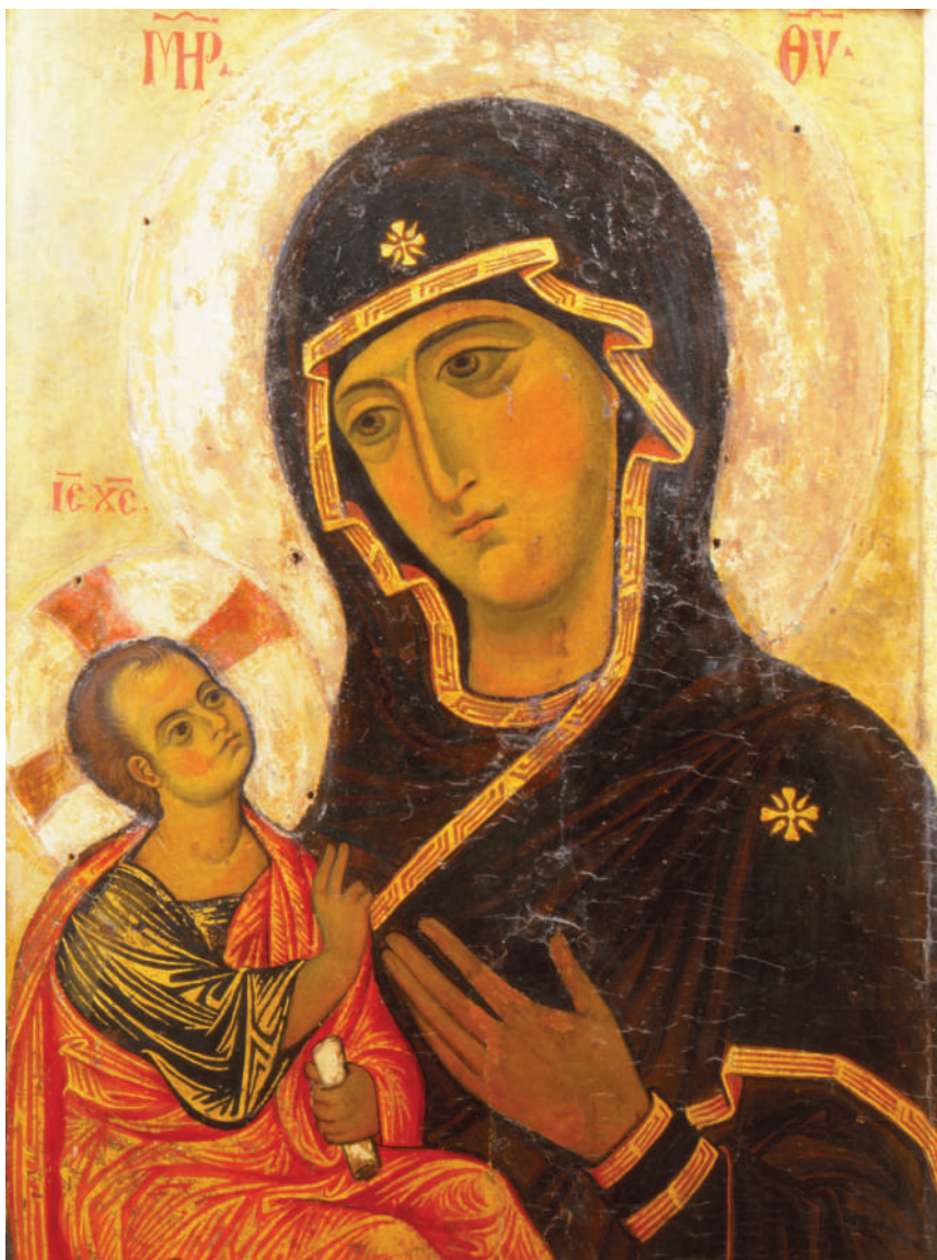
PLATE 6 Mother of God Hodegetria Iconostasis (13 th century) GROTTAFERRATA, EXARCHIC CHURCH OF SANTA MARIA